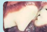
Healthy mouth with white teeth and healthy pink gums